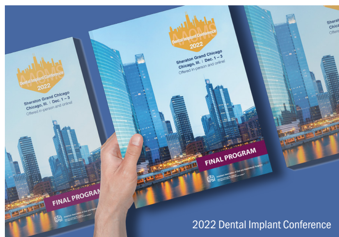
2022 Dental Implant Conference