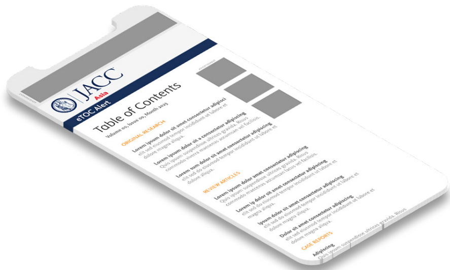
Table of Contents Email (eTOC) Advertising