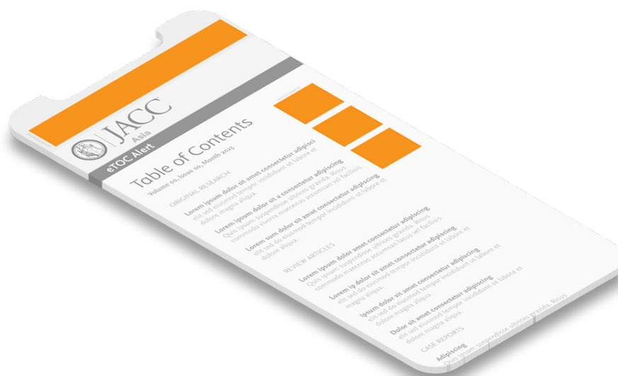
Table of Contents (TOC) Email Banner Ads