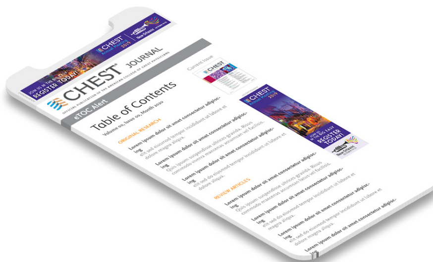
Table of Contents Email (eTOC) Advertising