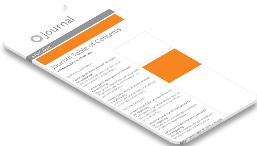
Table of Contents (TOC) Email Banner Ads